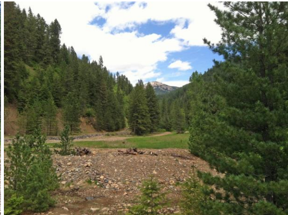
Highland Creek: Wardner Peak