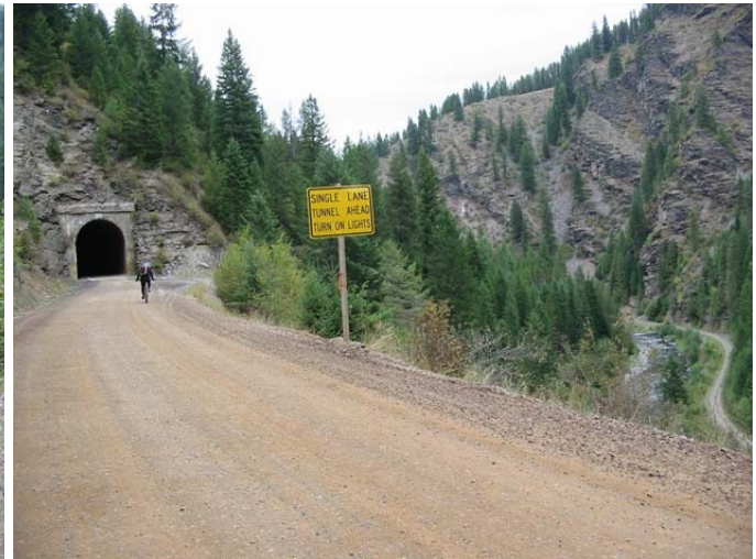
Tunnel 35 seen from both legs of the ride.