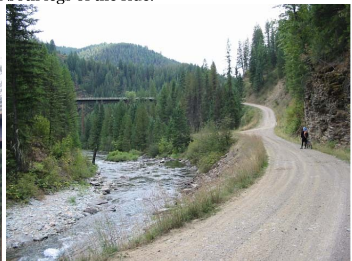
Trestle across N Fork St Joe River.