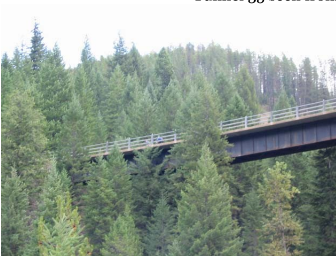
Trestle across Big Dick Creek.